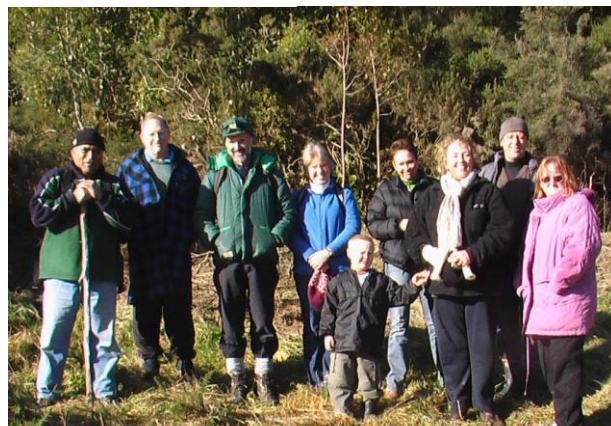
Runaka field trip to Orokonui Ecosanctuary